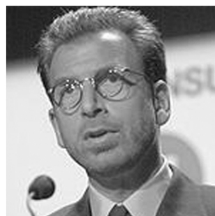
Edgar Bronfman, Jr. Universal Pictures/MCA