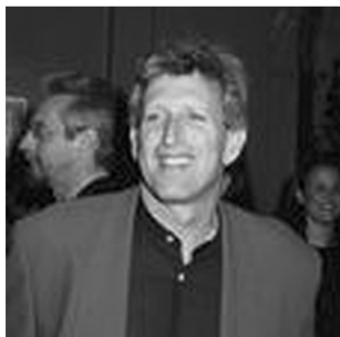
Joe Roth Touchstone Pictures Hollywood Pictures Caravan Pictures