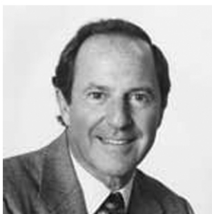
Mortimer B. Zucherman US News & World Report