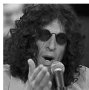
Howard Stern Radio Personality

THEY ALL CONTROL YOUR THOUGHTS, AND THEY ARE ALL JEWS.