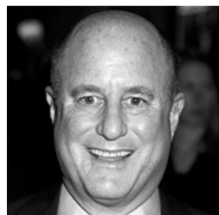
Ronald Perelman New World Entertainment