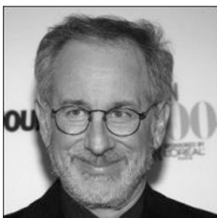
Steven Spielberg Film Director