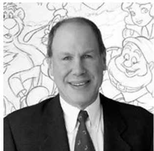
Michael Eisner Walt Disney Television Touchstone Television Buena Vista Television