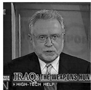
Wolf Blitzer CNN Journalist