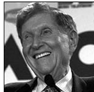
Sumner Redstone Viacom, Inc. Prentice Hall Simon & Schuster